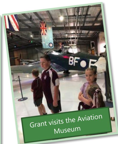
Grant visits the Aviation Museum