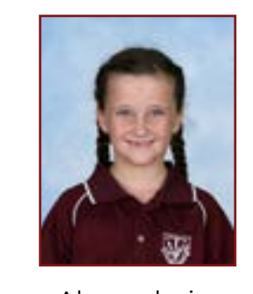
Always being a responsible and caring student at our school.