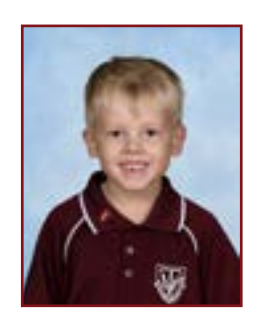
Shows kindness and willingness to help other younger students in the playground.