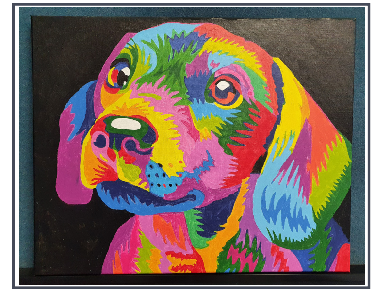
PUPPY ARTWORK- 5/6G

We have decided to give you a sneak peek of some the Fete Class Artworks which will be up for grabs later in the year. They look amazing!! If you are keen to make one of these beautiful artworks yours, we will have more details on how you can make this happen next term.