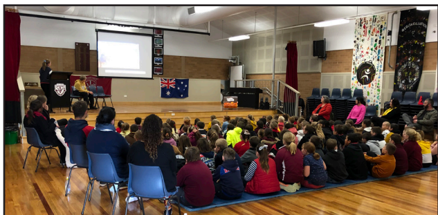
Reconciliation Day Assembly + PBL Awards