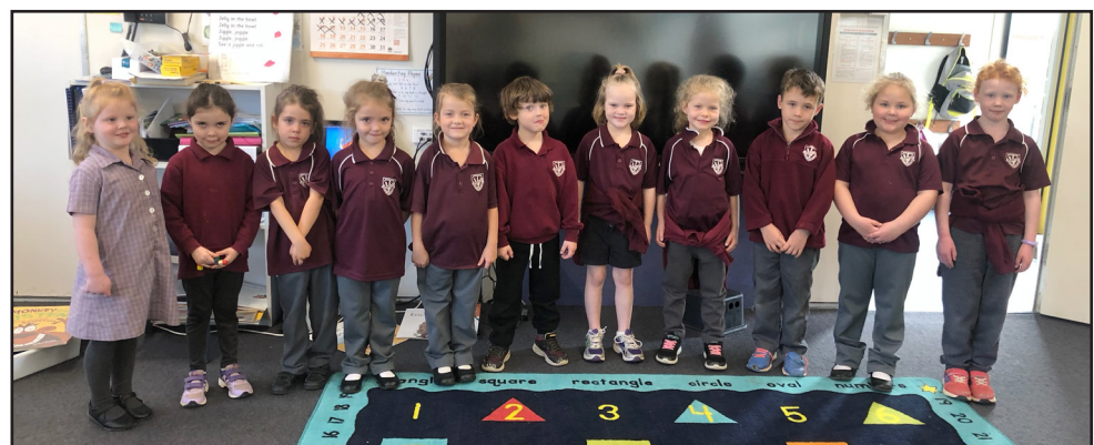
Kindergarten/Year 1 students learning about height in Maths