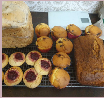
Beautiful home baked goods by Cooper G