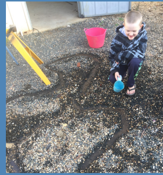
Archer and his river system: experimenting with redirecting the flow and path of water