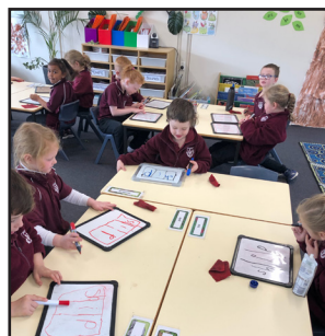
K/1 H hard at work!