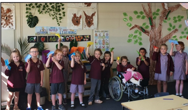
K/1 H measuring how far their paper planes can fly