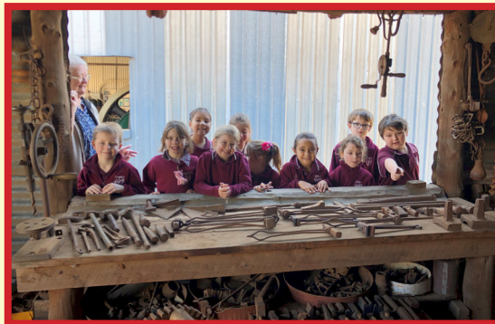
RURAL MUSEUM EXCURSION