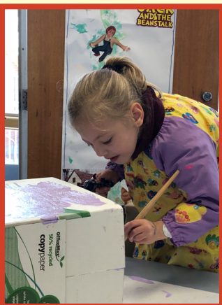
GETTING CREATIVE IN ART