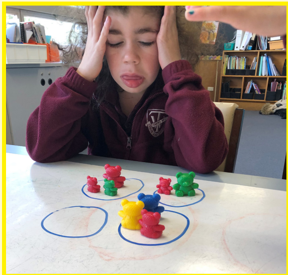
DIVISION IN MATHS