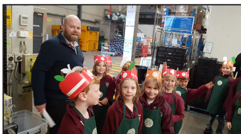
Woolworths Tour- Year 1B