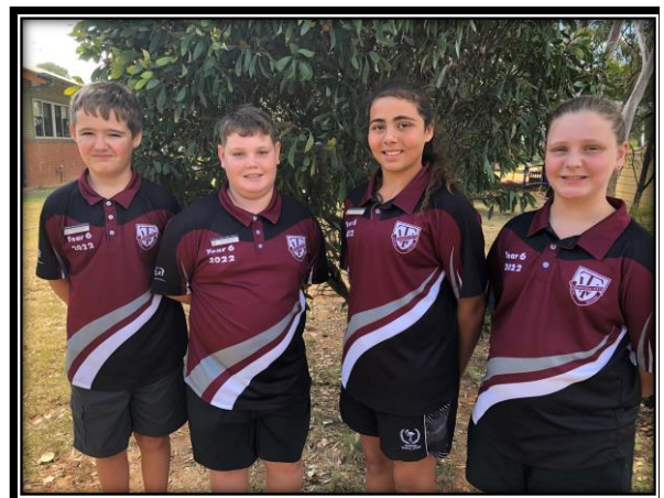
School Leaders 2022

In the early years strategies from the Count Me In Too (CMIT) Program are used to develop competency particularly in number work. By providing additional teacher time group sizes are reduced to enhance teaching and learning.